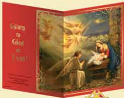
Angels Adore #6011

Verse Inside: May God grant you both now and always in your heart and in your home the heavenly peace of the Angels' song