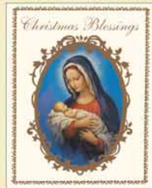
Mary and Child #2001

Verse Inside: Wishing you the presence of Christ in this holy season and in the days to come.