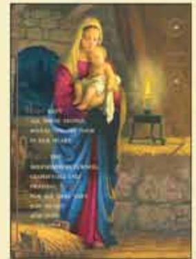
Our Lady of Light #2009

Verse Inside: May the Light Which Mary held In Bethlehem far away Now shine within your heart and home A Light of Faith – today!