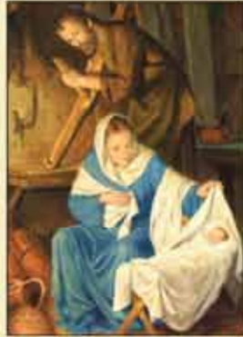
Holy Family #3010

Verse Inside: May your Christmas Day be filled with joy such as Mary and Joseph knew May the Christ Child bring you blessings to last you the whole year through