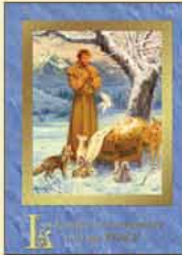
St. Francis Prayer for Peace #4011

Verse Inside: May the Lord Grant you His Peace In your heart and In your home